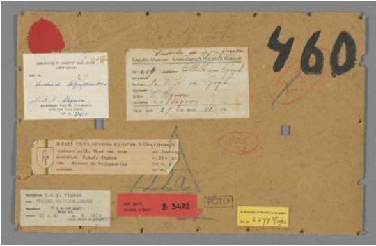
Woman in a Vineyard