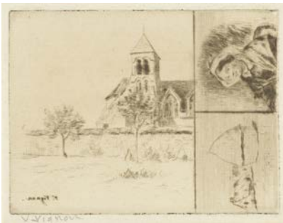
Victor Vignon, Landscape with Church, House with Haystack and Portrait of a Woman , undated, drypoint on paper, 9.8 × 13 cm (plate mark), 10.8 × 13.8 (paper), Van Gogh Museum, Amsterdam (gift of Annemarie Bergmans and Jaap Brouwer)

Raised in Villers-Cotterêts, a village northeast of Paris, from the second half of the 1870s Vignon spent most of his time in villages around the Oise region, northwest of the French capital. His view of the rural landscape was tinged with nostalgia: 'I like the countryside: I should like it to be the countryside of the past, far removed from any noise, still filled with the things of yesteryear.' 10 Not only his paintings but also the etchings he made over the years have rustic subjects (fig. 1) . While he occasionally titled his works with specific locations, more often than not they depicted a generic house, path or vista that could be found in any village. Consequently, determining the exact locations and dates of his paintings proves challenging. The possible exhibition date of Woman in a Vineyard in April 1880 probably places it in or before that year. It is known that during this period Vignon primarily worked in and around Auvers. 11