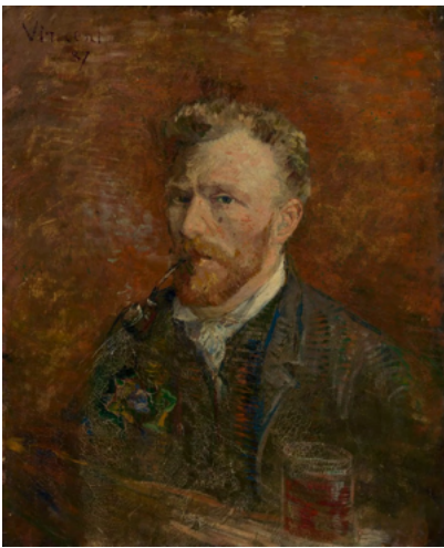
Vincent van Gogh, Self-Portrait with a Glass , January 1887, oil on canvas, 61.1 × 50.1 cm, Van Gogh Museum, Amsterdam (Vincent van Gogh Foundation)

Toulouse-Lautrec was adept at choosing a setting that reflected the personality of his model. 18 In the case of Van Gogh, it seems he found the café to be a fitting backdrop for his friend. The choice is not surprising considering that in Paris Van Gogh had developed a routine of hastening to a café at the end of his workday during the so-called heure verte , or ‘green hour’, to imbibe one or more glasses of absinthe. 19 Van Gogh himself confessed that when he left Paris for Arles in the winter of 1888 he was ‘almost an alcoholic’. 20 Paul Signac (1863–1935) recalled that when he visited his friend in the south, ‘the absinthes and brandies would follow each other in quick succession.’ 21 During the period when Toulouse-Lautrec depicted him, Van Gogh also portrayed himself twice in a café with a glass of liquor (fig. 1) . 22 He even devoted an entire canvas exclusively to his beloved green elixir, seen from the drinker’s perspective: ↗ Café Table with Absinthe (1887, Van Gogh Museum, Amsterdam).