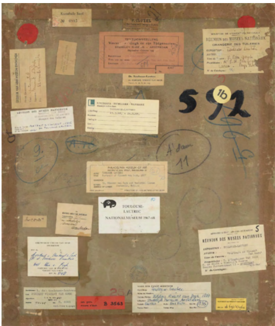
Portrait of Vincent van Gogh